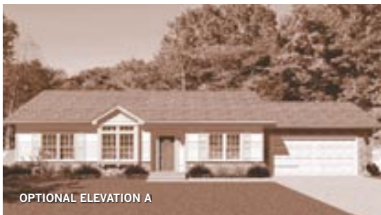
OPTIONAL ELEVATION A